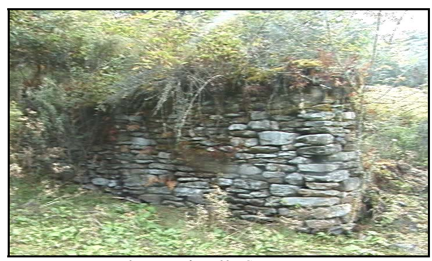
The Ruins of Bjetikha Guest House

The main responsibilities of neydag were to arrange water and fire ( chu okal me okal ), collect firewood, cut fodder for riding ponies,<sup>44</sup> and welcome guests. They provided these commodities to all travelers who reciprocated with food provision, butter, cheese and other goods. Their duties were greater when a Penlop traveled the road. A messenger would inform neydag and villages along the road of the Penlop's journey. When the Penlop approached Bjetikha, the neydag would welcome him with sang . The neydag was not required to provide food for the Penlop and retinue of porters. Early in