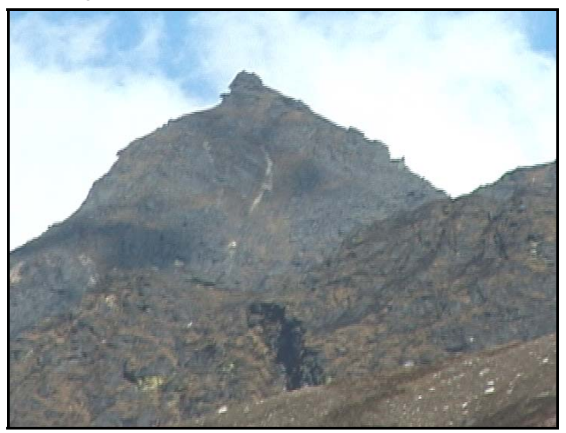
Aum Jomo Dagam's Citadel (Phodrang)

with defilements of birth and death. A visit by either king or men would be favoured with good weather. Like Bjop (her subject, patrons) she moves to warmer abode in Dagana during winter, and returns in the fourth month to reside in her summer abode in Labatama. If she is disturbed or not well propitiated, she sends predators like tigers to kill yaks, and inflicts man and animal with disease. But she is also known to bless her faithful patrons ( Bjop ) by multiplying their cattle and protecting health.