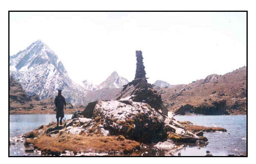
Drupkhang in Bjagaedtsho

Laatsho is the highest and the most sacred lake. It is located on the base of a small mountain next to Aum Jomo's citadel. Supposing that the mountain is Aum Jomo herself, Laatsho is located on her lap. It is considered as Aum Jomo's soelchhu since it is the highest, cleanest and nearest to her abode. Aum Jomo was known to have obstructed an initial attempt to introduce fish in the lake by enveloping the road and Laatsho with thick black clouds so that people could not see both the tsho and the road.