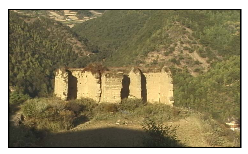
Ruins of Dagap Houses

traditional staple cereal crop then. The drungpa shared some<sup>12</sup> of the harvests with the people. Under this land tenure and taxation system, Dagap moved to Genyekha during summer to farm their land, and in the process they travelled the Genyekha-Dagana zhunglam frequently. They also had to pay other taxes not available in Genyekha in kind. After the post of drungpa was abolished, Dagap passed on their zhing to the locals,<sup>13</sup> and their seasonal movement hence came to an end.