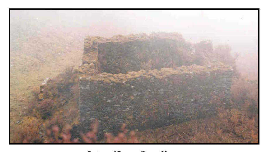
Ruins of Doma Guest House

winter. Gora and Changphetorsaigang tsamdo can be seen from the house. There is a road leading to Kadori tsamdo . From Sipsarbu, some parts of the roads are beautifully paved with stone slabs. Doma<sup>33</sup> is a big tsamdo located at an altitude of 3700 meters. There are ruins of a guesthouse called Doma Gyem Khyim. A rectangle-shaped double-storied stone house was built by Dagap as guesthouse for Daga Penlop. Penlop and travelers shared the upper floor, while horses were sheltered in ground floor.<sup>34</sup>