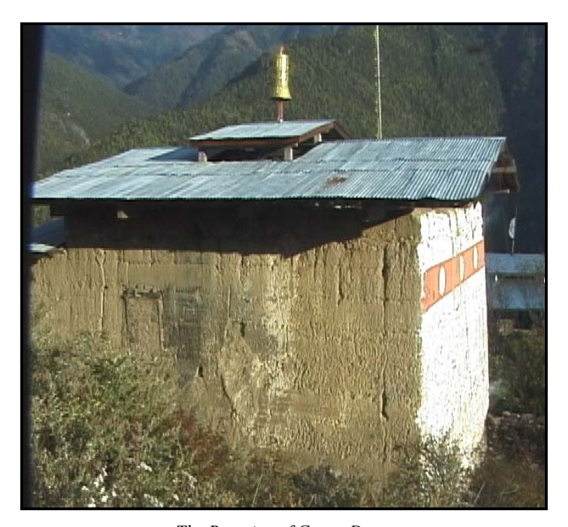
The Remains of Genye Dzong

After the coming of motor road, socio-economic conditions improved. Farmers shifted their farming pattern from a simple subsistence to limited commercial farming. They started to grow potato and pea, and exported to Phuntsholing. Matsutake and chantarelle mushroom found in abundance in the region brought in much needed cash. Farmers now own power tillers for potato and wheat cultivation. A group of villagers (both children and adult) have enrolled in the nonformal education programme.