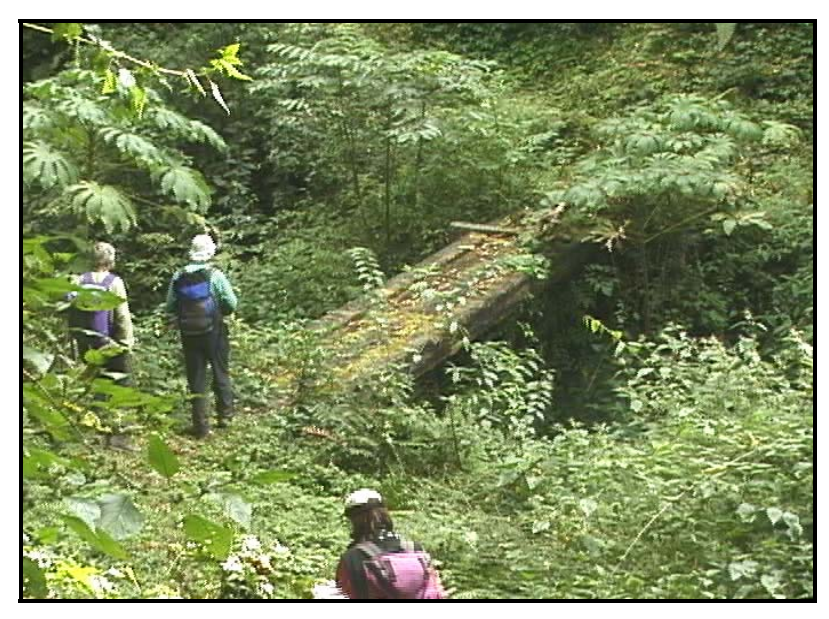
A Wooden Plank Bridge over Churalung

Churalung is a stream. There was once a chura - a traditional water mill built over the river, like the one in Genyechhu, where travellers normally ground their grains. There is no trace of chura today.<sup>46</sup>