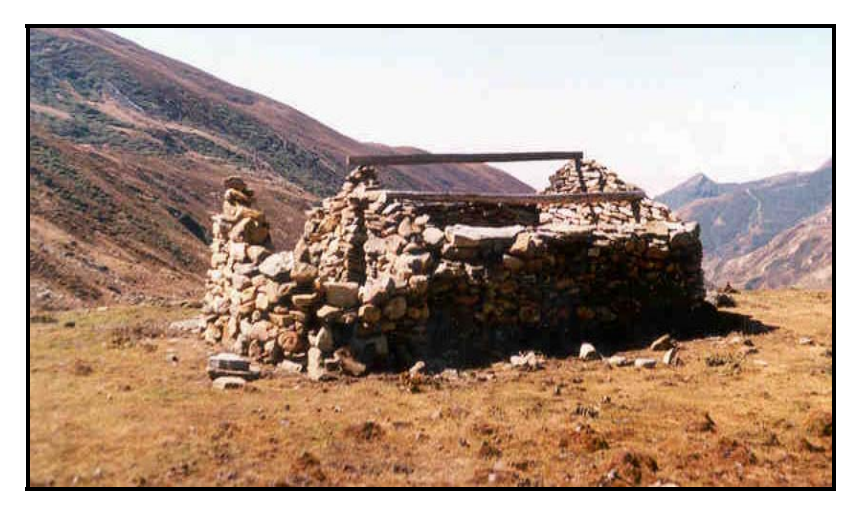
A typical Bjop khyim (cowshed)

Gyalkha<sup>22</sup> are known as Dunbjop. Wambjop constitutes 30 households north of Zhugthri Gyalkha, while Jartala consists of six households in various tsamdo in the Dagala ranges above Tsimalakha.<sup>23</sup>