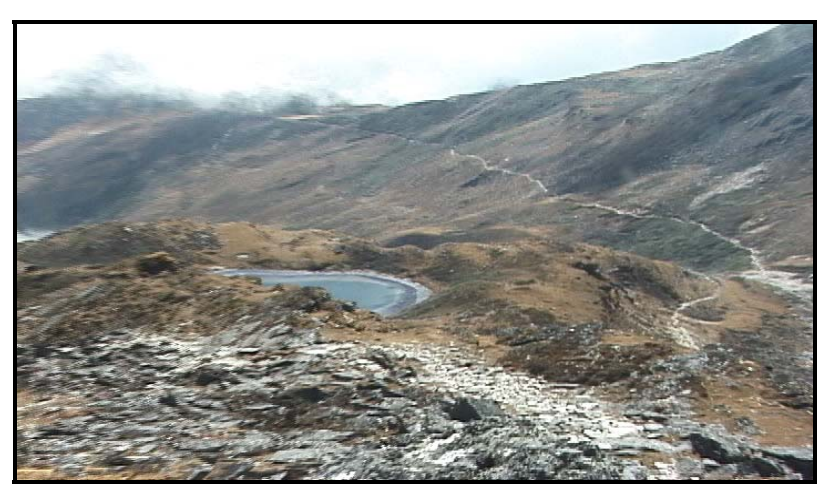
Langtsho and the road beyond Lawagu

From Lawagu Laptsa, the road zigzags down a steep and rocky mountain slope, and passes between Tatsho and Langtsho. There is a small stone bowl above the road where people drop coins as nyendar . The road is difficult for horses. Tatsho was earlier a big lake, but it has dried up after Aum Tshomen escaped to some other place. The Bjop believe that a horse used to appear from the lake. Langtsho is below Tatsho and the road passes above it. People believe that a yak used to appear on the shore and impregnate cows. There is a ruin of a Bjop Khyim in Sipsarbu tsamdo at the base of Goraigang. The Bjop used to live there in ancient days, but it was later abandoned after dud residing in the opposite mountain terrified the people. The walls of the two-storied house are intact, and it is now used for sheltering sheep from cold