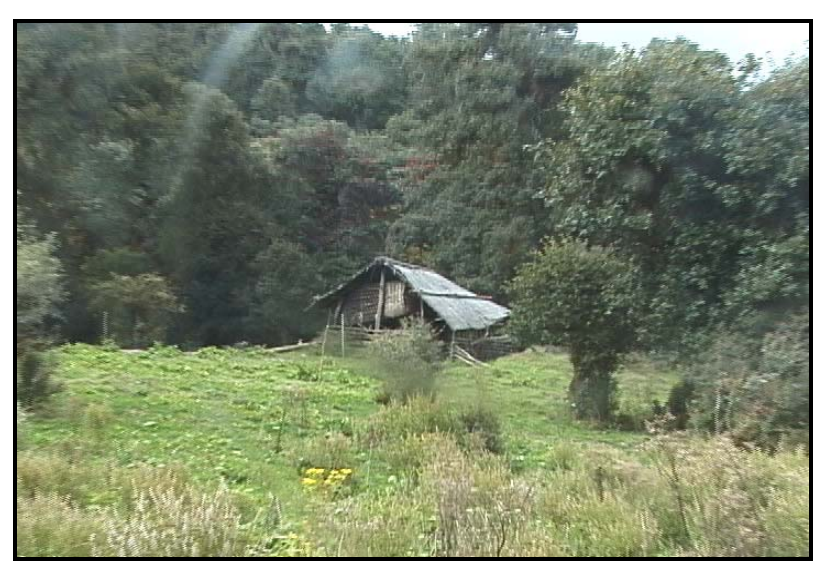
A Dagap Cowshed in Bjitekha

Some dominant trees after passing Wangroo are daegishing (paper tree), aetoshing , bjishing and kharshing . A bamboo species called heeman (reeds) is found in abundance. Karshishing is dominant after crossing a stream called Gyem Semchelungichhu. Za is extracted from karshishing for making phob (cup). Thomshing and phagishing also grow abundantly. People use thomshing leaves to make traditional medicine, while dob and other containers for milking and churning are mostly made from phagishing .